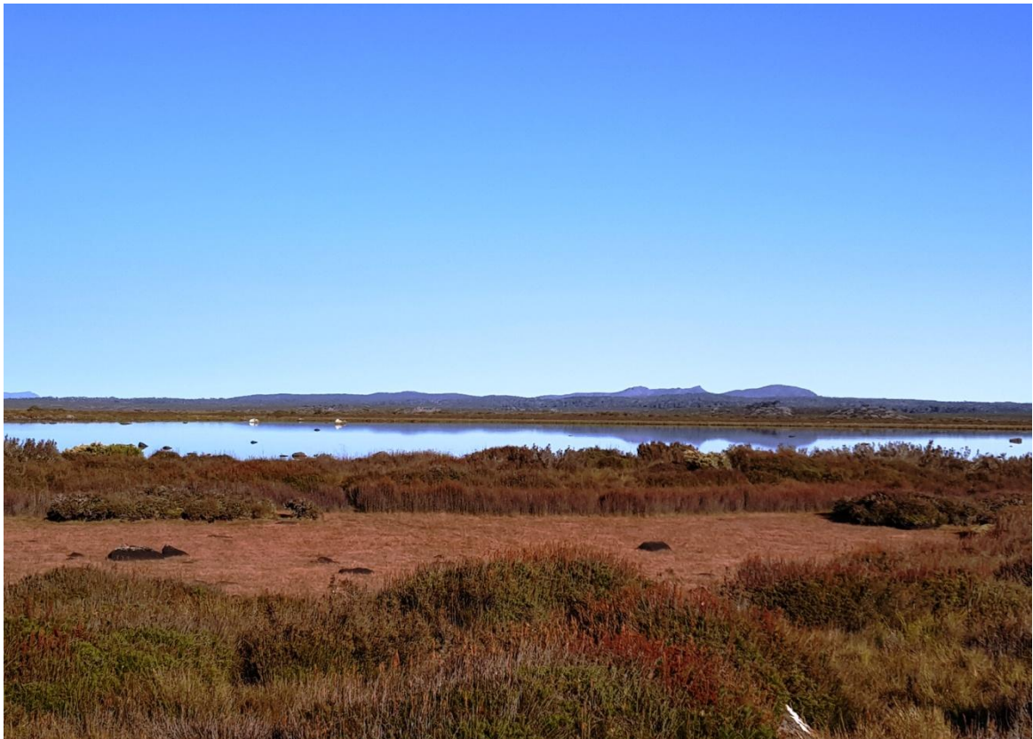
Rocky Lake Tasmania