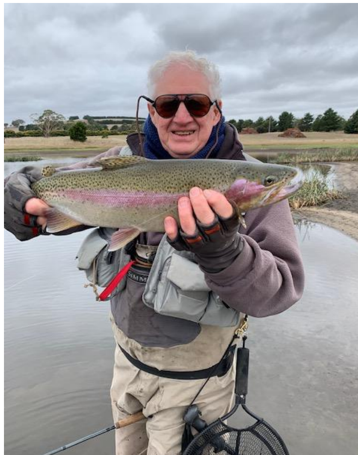
Lyntons Dodger's Rainbow

More details will be provided in the next few weeks