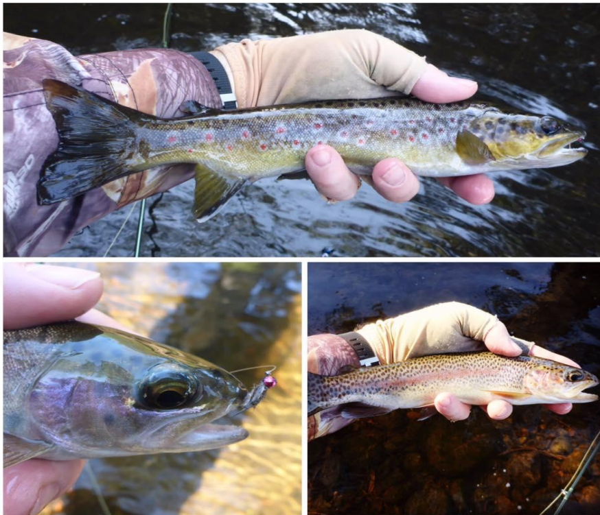
Paul's Day Out with small stream nymph munching Trout in the Cathedral Ranges.