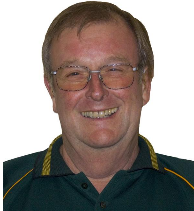
YVFF Member May 1998- 2015