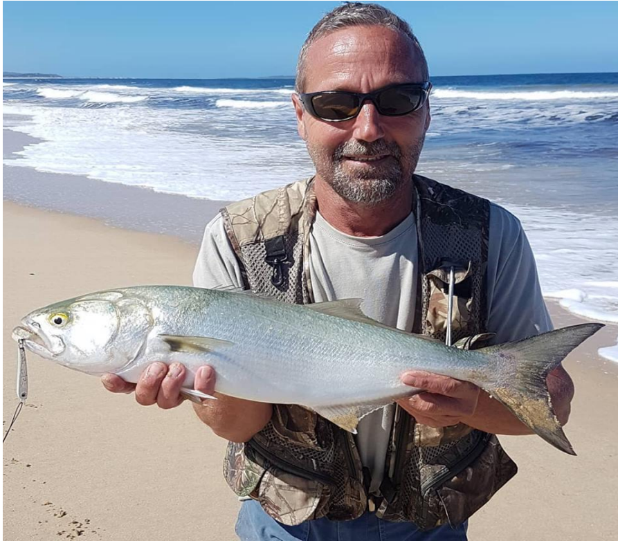
Lionel's 65cm Tailor caught on a metal lure at Mallacoota.